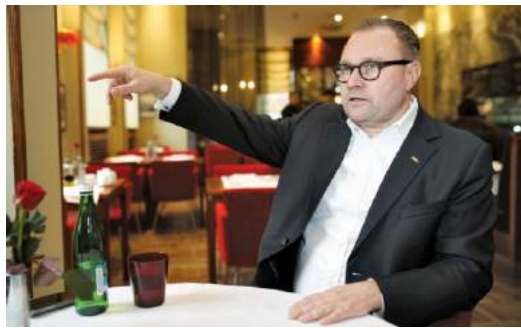
Ukraine should make it easier for business and tourism