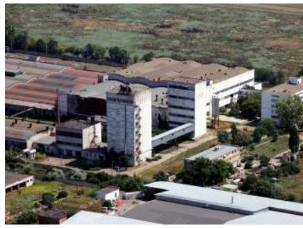
Industrial and logistics complex in Odessa